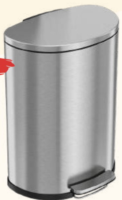
13.2 Gallon Stainless Steel Semi-Round with Plastic Liner (HLSS13D) 13.2 G / 50 L 14.75" L x 19.8" W x 26.4" H