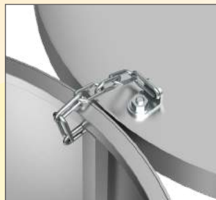
Lid Security Chain