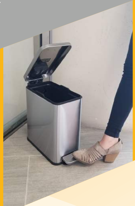
3 Gallon Slim Step Pedal with Plastic Liner (HLSS03R) 3 G / 10 L 13.5" L x 6.5" W x 15.5" H