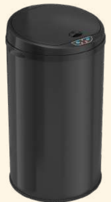
8 Gallon Black Round Sensor (HLS08RB) 8 G / 30 L 12.6" L x 11.6" W x 20.2" H