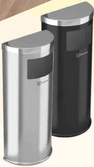
9 Gallon Half-Round Side-Entry Stainless Steel and Black Powder-Coated* (HLSC01G09A / HLSC01G09B) 9 G / 34 L 15.7" L x 7.9" W x 35.4" H *may be wall mounted