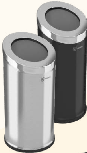
15 Gallon Round Beveled Open Top Stainless Steel and Black Powder-Coated (HLSC04G15A / HLSC04G15B) 15 G / 57 L 14.9" L x 14.9" W x 31.5" H