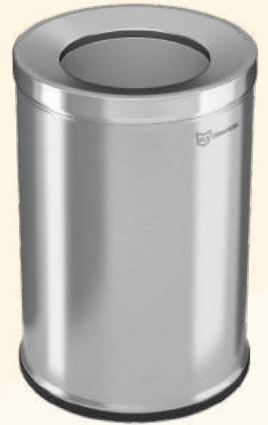
26 Gallon Stainless Steel Round Open Top (HLSC05G26) 26 G / 98 L 18.9" L x 18.9" W x 28.7" H