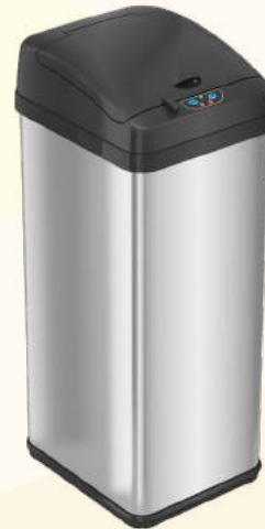
13 Gallon Stainless Steel Rectangular Sensor (HLS13MX) 13 G / 50 L 12.9" L x 10.75" W x 28.25" H