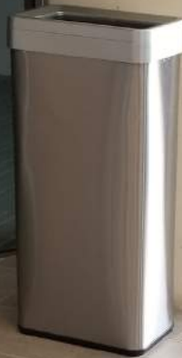
18 / 23 Gallon Stainless Steel Semi-Round Open Top (HLS18DOT / HLS23DOT)