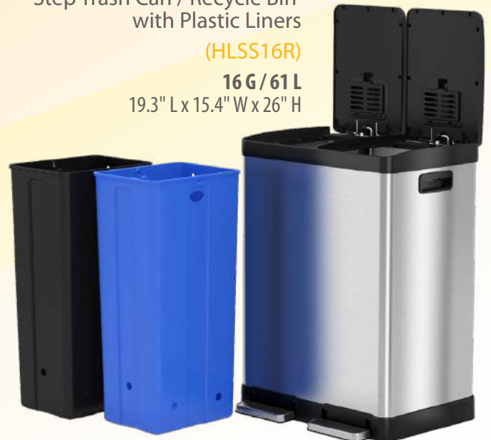
16 Gallon Stainless Steel Step Trash Can / Recycle Bin with Plastic Liners (HLSS16R) 16 G / 61 L 19.3" L x 15.4" W x 26" H