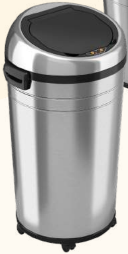
23 Gallon Stainless Steel Extra Large Round Sensor with Removable Wheels (HLS23RC) 23 G / 87 L 19.25" L x 17.5" W x 32.6" H