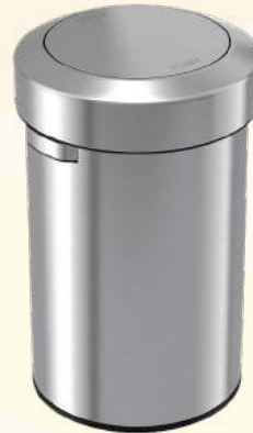
17 Gallon Stainless Steel Round Swing Top (HLS17FTS) 17 G / 64 L 16" L x 16" W x 25.5" H