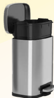
13.2 / 8 / 1.32 Step Pedal with Plastic Liner (HLSS13R / HLSS08R / HLSS01R) 13.2 G / 50 L 16.75" L x 12.5" W x 26" H 8 G / 30 L 13.7" L x 11.8" W x 25" H 1.32 G / 5 L 8.5" L x 7.3" W x 11.8" H