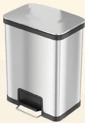
13 G / 50 L 16.5" L x 12" W x 22.25" H 18 G / 68 L 16.5" L x 12" W x 28.5" H