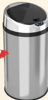
8 Gallon Stainless Steel Round Sensor (HLS08RCB) 8 G / 30 L 12.75" L x 12" W x 22.25" H

A diverse range of size and shape options. Bins fit standard liners.