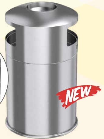
50 Gallon Indoor / Outdoor Round, Side Entry Stainless Steel with Removable Ashtray (HLS50DSI - Indoor / HLS50DSO - Outdoor) 50 G / 189 L 21.7" L x 21.7" W x 40.2" H