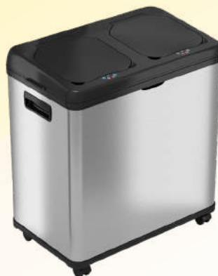
16 Gallon Stainless Steel Combo Sensor Recycle and Trash Can (HLS16DCSS) 16 G / 61 L 23.13" L x 13.88" W x 22" H