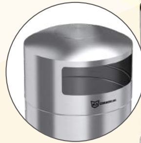
Ashtray cover included