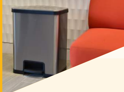
16 Gallon Stainless Steel Combination Recycle and Step Trash Can (HLSS16R) 16 G / 61 L 17.3" L x 21.6" W x 28.3" H